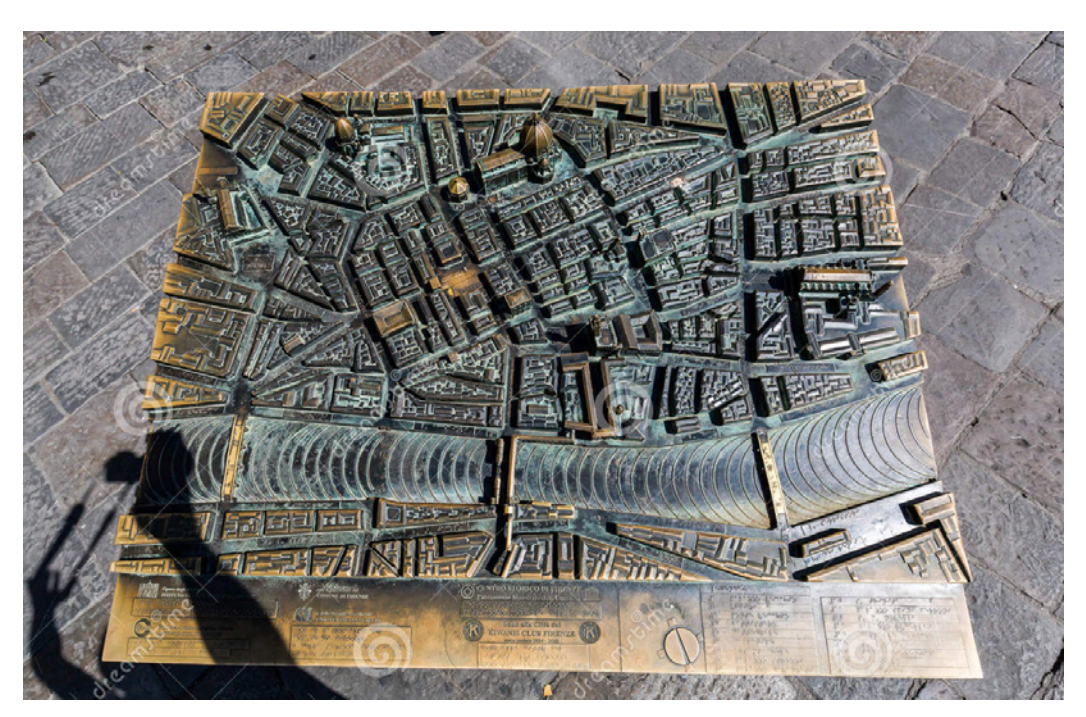
DESIGN INSPIRATION - HISTORICAL MAP MONUMENT