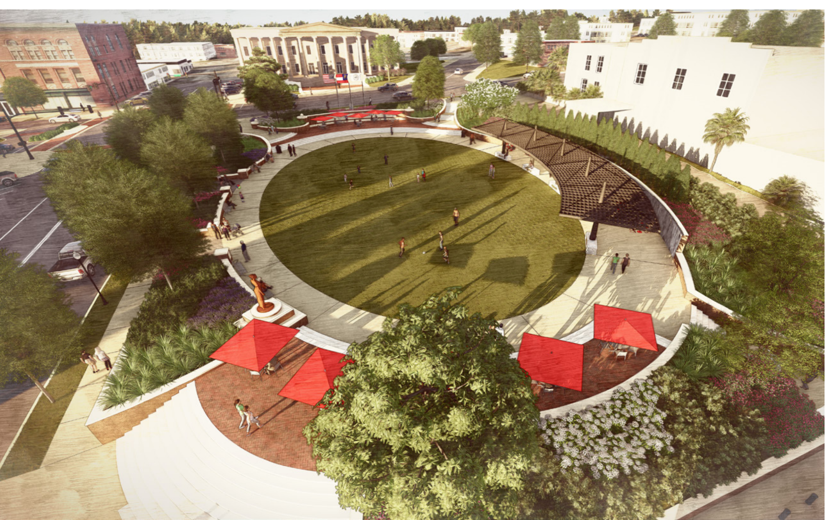
OVERALL PARK VIEW