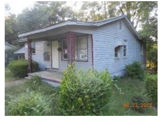
Typical Home On Kitchens Road

Goal: The goal is to complete ten 5 x 5 events a year, 5 square blocks for 5 weeks once a year equals an estimated 250 square blocks a year.