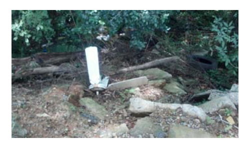
Dumping in a ravine on Kitchens Road