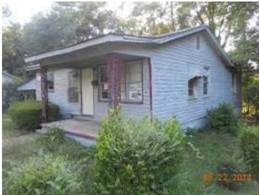
Typical Home On Kitchens Road

Goal: The goal is to complete ten 5 x 5 events a year, 5 square blocks for 5 weeks once a year equals an estimated 250 square blocks a year.