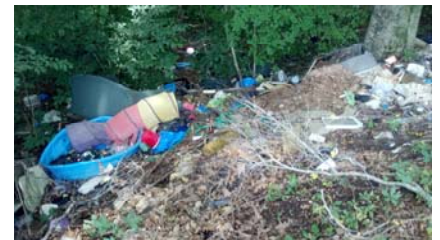
Dumping in a ravine on Kitchens Road