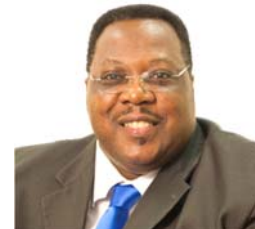
Commissioner Al Tillman

"The people in District 9 are to be commended and celebrated for the way they stepped up to improve their neighborhood during this round of the 5 x 5 Program. From regular cleanups to a family festival to filling up a large dumpster several times, this is the kind of partnership and effort that will help make sustainable improvements over a longer period of time. "